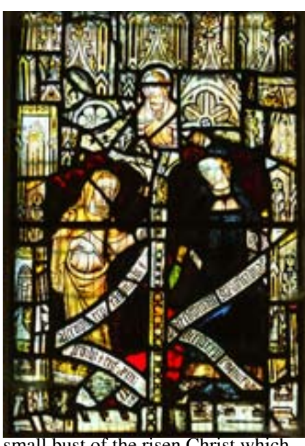
small bust of the risen Christ which has been leaded into the panel.

The Anunciation scene depicted in the top row of the main lights (left and central panels) is especially beautiful. Gabriel's robes are sumptuous whilst the details displayed in Mary's clothing and features are exquisite.